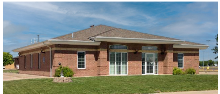
Hays branch located at 2825 Plaza Ave.

Following the merger, Heartland is now over $525 million in assets, with 135 employees serving more than 34,000 members across Kansas and beyond.